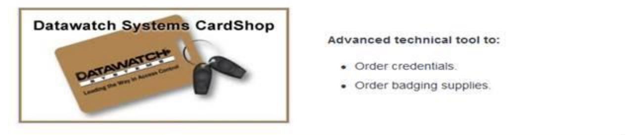
(Click Picture for direct link to "<u>Cardshop</u>")

3) Under Client Tools Select "Cardshop" (Second option right under direct-access)